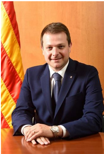
GERARD M. FIGUERAS General Secretary of Sport and Physical Activity Government of Catalonia

It is indeed an honour for the General Secretariat of Sport and Physical Activity to back such a unique and exciting tournament. I encourage everyone to enjoy as much as possible what will undoubtedly be a fantastic show.